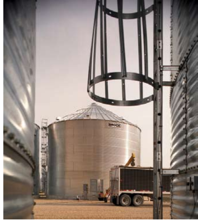
Well aerated bins preserve cereal grains at its best.

Storage moulds are prevalent in storage facilities when the grain moisture content is too low for field moulds (less than about 20%). The moisture and temperature requirements of these moulds determine the safe storage period. By controlling moisture content and temperature, mould growth is restricted and grain can be dried without significant spoilage. Grain temperature and moisture content determine the allowable