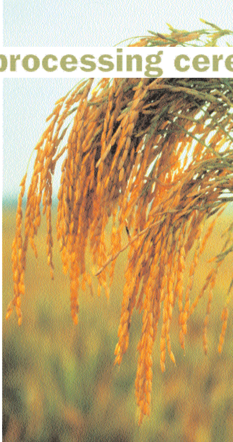
Gelatinisation of starch through expanding improves the digestibility at the small intestine level. The degree of gelatinisation is not fully clarified yet.

It is known that fine grinding of cereals improves nutrient digestibility, probably at expenses of mucus health and intestinal comfort, and that pelleting consistently reduces feed wastage and improves pig performance. However, few data exist on the benefits of using heat-processed cereals in diets for monogastrics. The available data do not always favour the use of processed