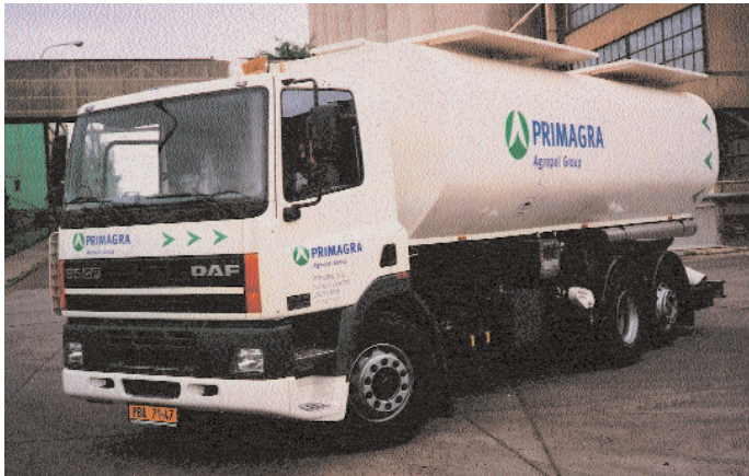
The companies in the Agropol Group renewed the fleet for compound feed transport by containers on DAF undercarriages.

mercial services mainly in trade activities oriented abroad.