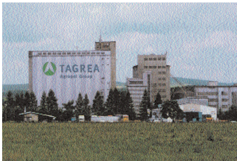
One of the agro-centres of the Agropol Group – the company Tagrea (grain silo and compound feed plant).

Another 0.6 million tonnes are produced by home mixing farmers using simple technical equipment or compound feed mobile plants.