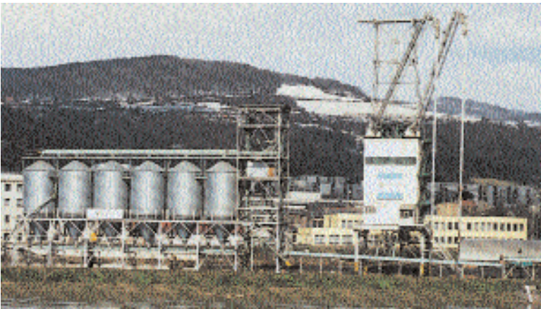
The fluvial port on the river Elbe with the Agropol Port's goods loading facility provides transport of feed components, in particular of soy, from the Hamburg sea port.

slovakia were built according to the set rules of the projects and were equipped with machines of domestic make. Only few plants were equipped with imported technology, such as Bühler. In recent years, however, the compound feed plants were considerably modernised including implementation of domestic grinding mills, pellet presses and imported mixers, and weight systems for micro ingredient proportioning. No expanders and extruders have been used in the feedmills so far.