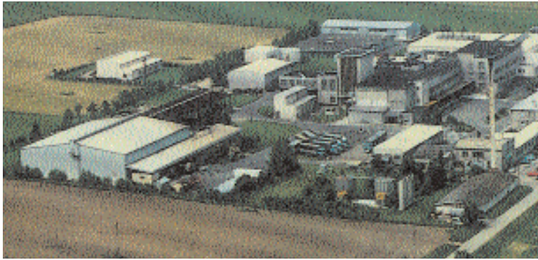
Slaughter and operations for poultry meat processing in Jihočeská drubež, a member company of the Agropol Group holding.